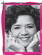
Sonia Manzano (“Sesame Street”)