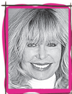
Loretta Swit (“M*A*S*H”)